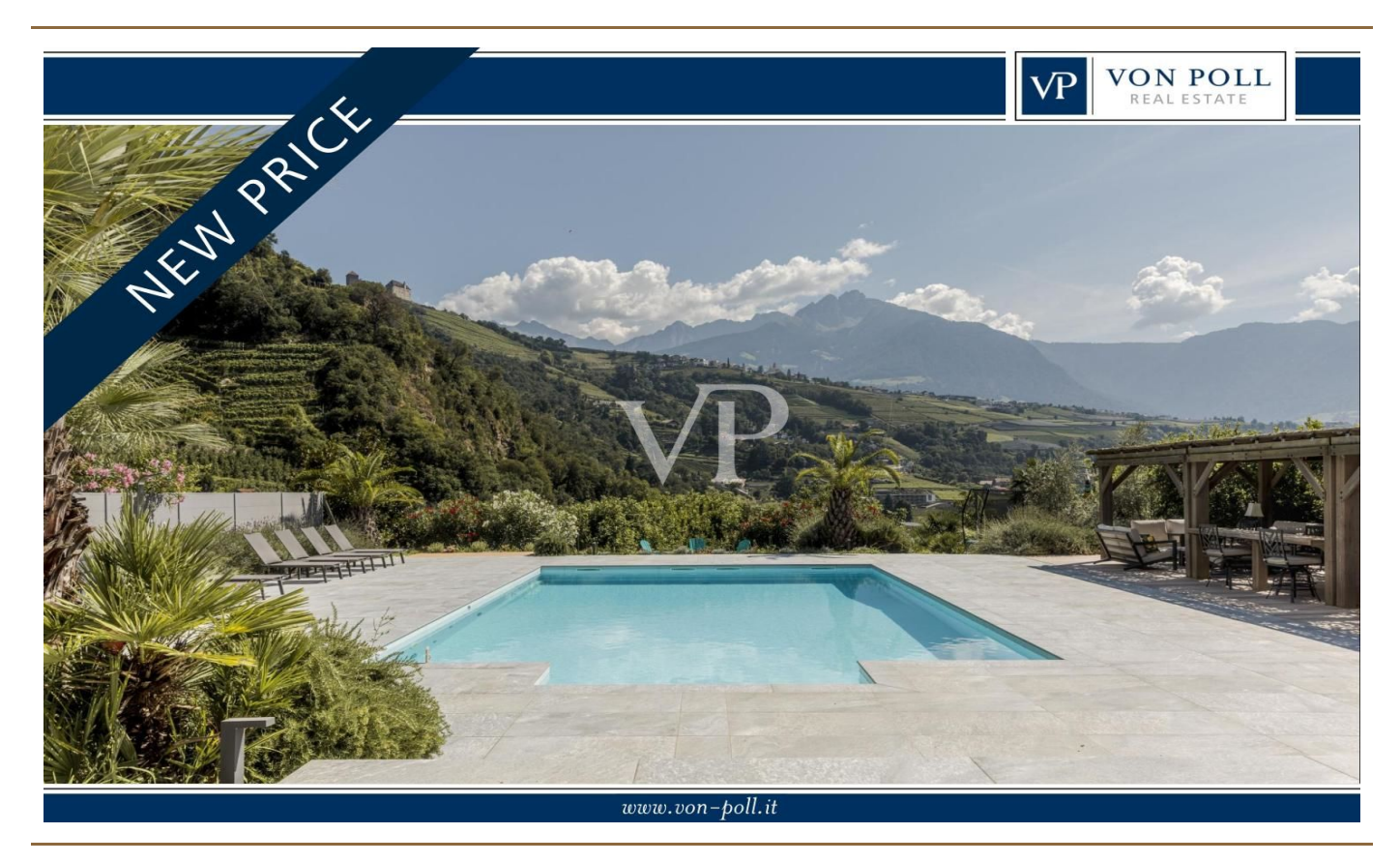
LIVING SPACE: ca. 266 m^2 \, \bullet \, ROOMS: 7 \, \bullet \, LAND AREA: 1.442 m^2