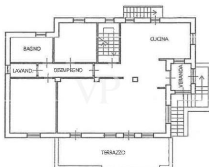
PIANO PRIMO H. = mt. 2,90