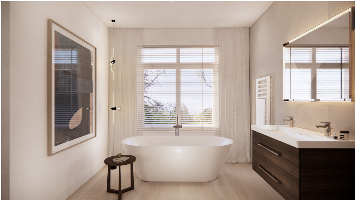
Burgemeester Nawijnlaan 38